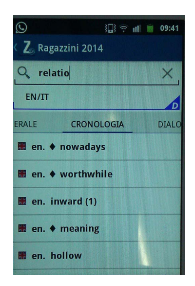
Figure 1: Search Chronology in Ragazzini 2014 app.

Despite the bold character and underlining, students often disregarded the second part of the request; however, behind each student was an observer that took notes of the ways they consulted the dictionary. Only the app version, and not the one online, allowed the researcher or teacher to access a type of log file using the "chronology" of the words searched (see fig.1)